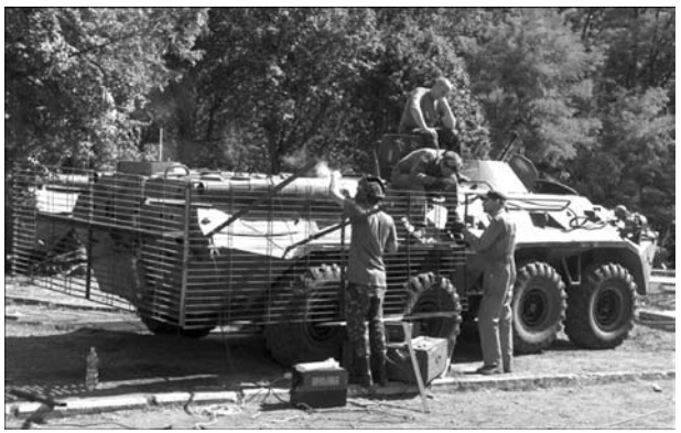
Assembly of anti-cumulative screens on armored personnel carrier BTR-80 of the Armed Forces of Ukraine in the ATO zone by the Chair staff members

Due to cooperation with the Central Research Institute of Armament and Military Equipment of the Armed Forces of Ukraine into the design of screens and technology of their manufacture a number of improvements was introduced. The screens successfully passed ballistic tests at the site of the Ministry of Defence of Ukraine. The application for a patent was drawn up and the works on adoption of the screens of the given type for the armament are carried out. Today by the efforts of students a single production in the