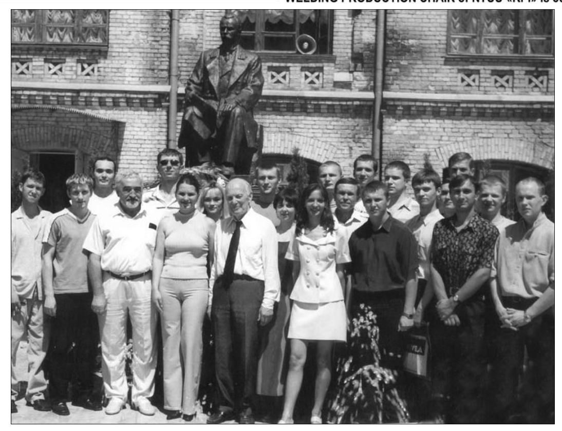
Unveiling of monument Evgeny Paton at NTUU «KPI»

the absence of teaching personnel the education of welding production engineers in Tashkent was not carried out.