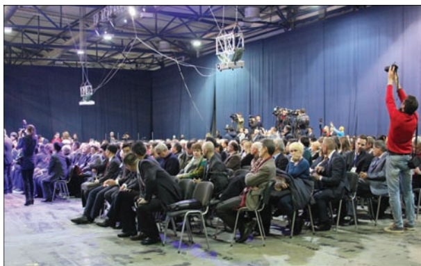
Opening ceremony of «Innovation Forum»