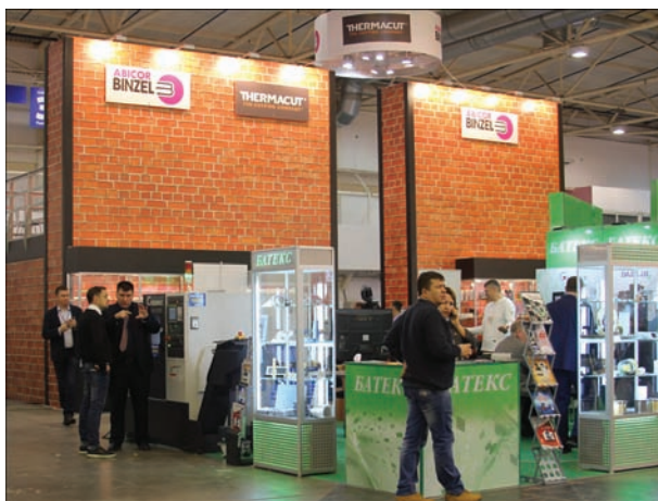
At Binzel Ukraine booth