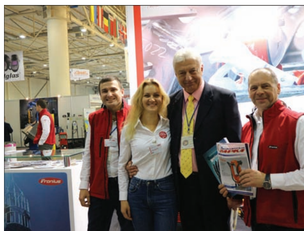
At Fronius Ukraine booth

booths and their information content. In the opinion of exhibition participants and visitors, the Forum in 2017 exceeded all expectations: clearly there is progress in the field of innovative proposals from exhibitors and increased interest of visitors to the exposition.