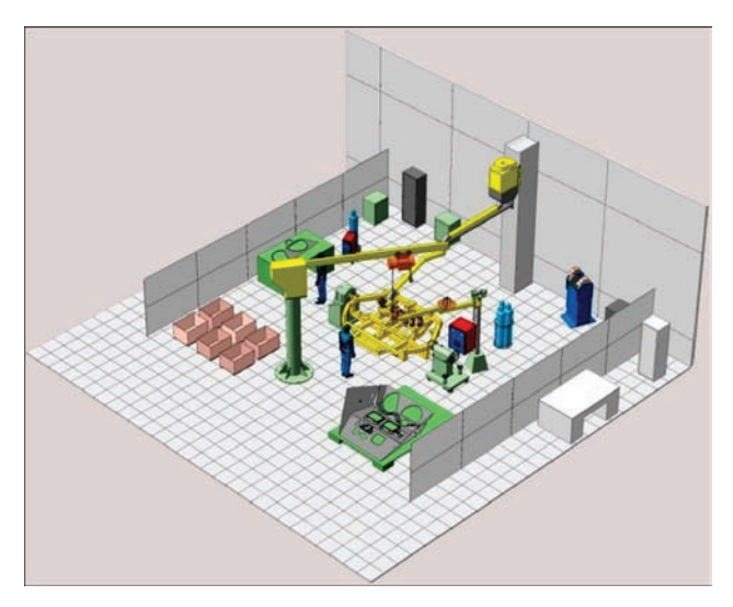
Example of welding site for manufacture of welded hull enlarged unit

The specialists of the SE «Experimental Design and Technological Bureau of the E.O. Paton Electric Welding Institute» developed a technology which allows designing a versatile, continuous positioning industrial manufacture of welded hulls of light-armored wheeled and caterpillar machines.