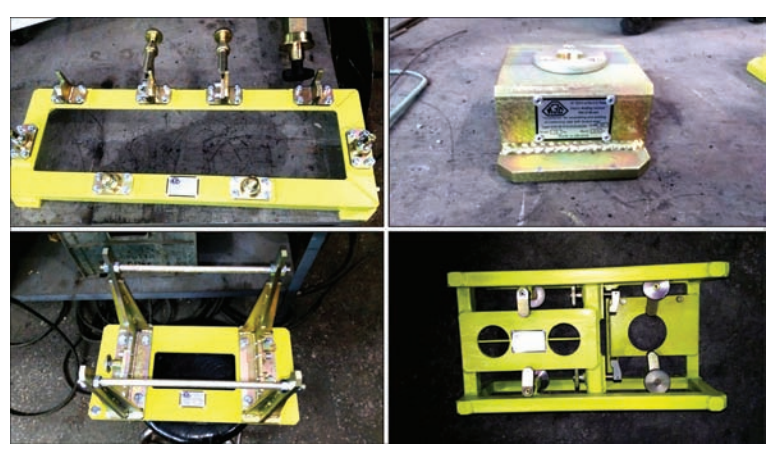
Stands for manufacturing of intermediate composite parts of light-armored wheeled machines

According to the existing technology the hull is welded successively, part-by-part in a stationary stand, representing a berth with a large number of auxiliary technological devices, which significantly complicate the work of welders. At the same time 80–85 % of welds have to be produced on steep, vertical and overhead planes. The making of such welds is quite labor-intensive and difficult to produce and can be qualitatively made only by highly-skilled welders. Moreover, the efficiency of one stand is approximately one hull per a month. When it is necessary to produce the hulls of other type, the stands require a complete re-equipment.