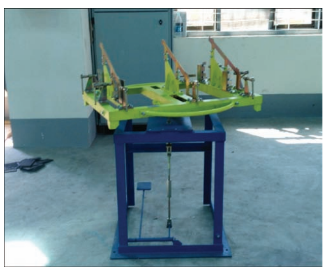
Installation for assembly and welding of motor compartment elements

The separation of welded hull into separate components (sections) is made taking into account the labor-intensiveness of manufacture of sections, bearing in mind the achievement of balance of this index between the separate sections. The technology of creating the welded hull of enlarged components (sections) which are manufactured at separate production sites allows a more rational use of manufacturing areas, providing a uniform loading of workplaces and operators (welders) and, accordingly, increase in labor efficiency, saving energy resources and welding consumables, as well as rhythmic work of the entire welding production of hulls. The use of this technology allows increasing the production capacity of hulls up to 20 pcs per a month (with a two-shift work), significantly reducing the requirements to qualification of welders and improving the quality of welded joints.