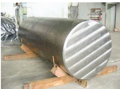
Titanium ingot of 1100 mm diameter

Chemical composition of the ingots meets the requirements of the local and foreign standards GOST, ASTM, AMS, etc. (ISO 9001 Quality System Certificate).