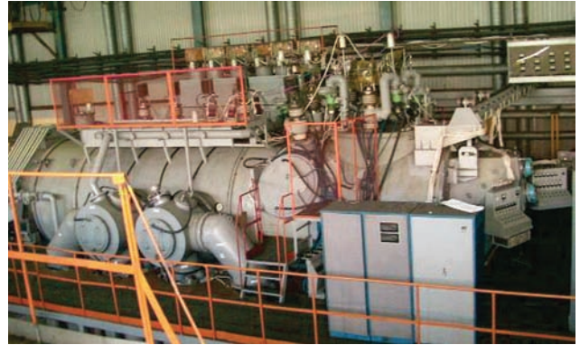
All-purpose electron beam unit UE-5810

based on titanium and other metals by EBM method.