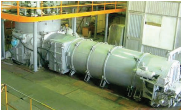
Electron beam unit UE-5812

At present, industrial production of titanium alloy ingots by the method of electron beam cold-hearth melting (EBM) is organized in the facility of SE «SPC «Titan» of the E.O. Paton Electric Welding Institute of the NAS of Ukraine» with equipment providing 3000 tons total annual capacity. Company specialists continue work on creation of new titanium-based alloys, develop and manufacture locally-produced equipment and technology of ingots melting