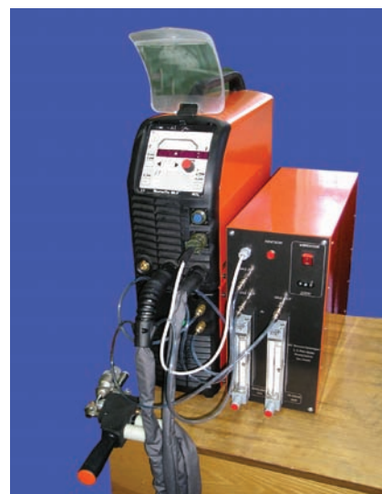
Unit for microplasma spraying MPN-004 with powder batchbox

This technology allows depositing coatings from hydroxyapatite powder (HA), titanium cellular coatings as well as double-layer biocermet (titanium-hydroxyapatite) coatings. Spraying of biocompatible coatings is done on microplasma spraying unit MPN-004. PLASMATRON FOR SPRAYING OF COATINGS Pub. No.:WO/2004/010747, International Application No.: PCT/UA2003/000014, Publication date: 29.01.2004. (IRP4).